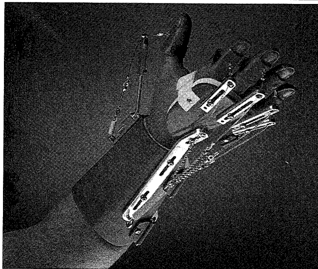
Figure 18-10 SaoboFlex dynamic orthosis.

The Functional Tone Management (FTM) Arm Training Program was developed by Saobo Inc. to address the weaknesses of therapeutic interventions currently applied to the neurologically impaired upper extremity (UE) and hand. The occupational therapists that founded Saobo, theorized that because grasp and release capabilities are pivotal to UE integrating the UE into daily activities, a paradigm shift for UE neurological rehabilitation was needed. While traditional therapeutic interventions such as Bobath-based programs are based on a proximal to distal recovery pattern, Saobo developed their FTM Arm Training Program based on a distal activation model, focusing on the key point of early initiation of UE movements that incorporate grasp and release. In Saobo developed a dynamic orthosis for the hand, called the SaoboFlex (Figure 18-10). The SaoboFlex orthosis assists an individual who exhibits hypertonia in the hand to place the hand in an open,